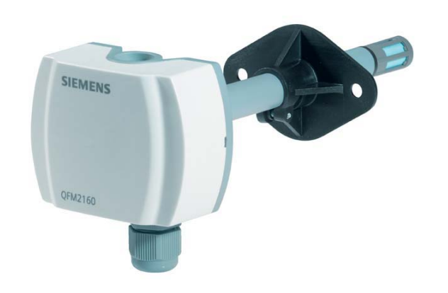
Figure 1: Q-Series Duct Relative Humidity and Relative Humidity & Temperature Sensor.